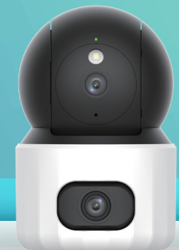
panda B Indoor Smart Camera