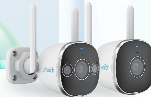
panda B Outdoor Bullet Camera