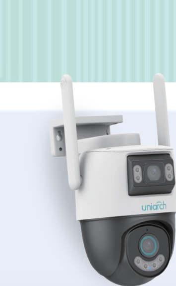
panda P Outdoor PT Camera

Wi-Fi camera fully upgraded, design inspired by pandas.